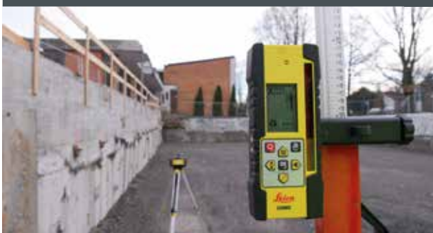
HORIZONTAL & SLOPE LASER