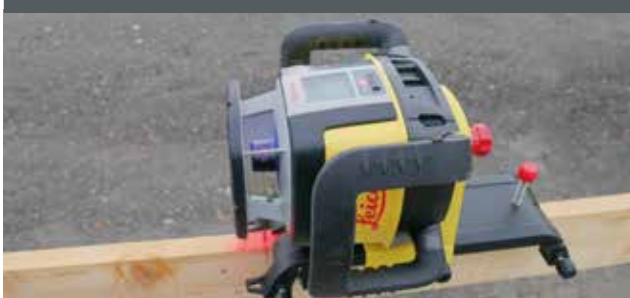
HORIZONTAL, VERTICAL & MANUAL SLOPE