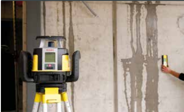
HORIZONTAL ONE-BUTTON LASER